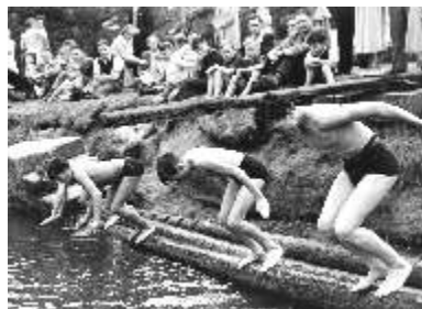
Latton Lido race c1948

There are still several single Cricklade Revealed books available at £3 each, covering the war years and the 1950s/1960s. For further details please contact me on 01793 750542 or email mfp Parsons071@btinternet.com